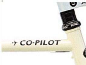
Quality:Chris King headset and headtube rings

SIZES: 50,52,54,55,56,57,58,59,60 (tested),62cm