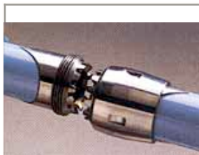
S&S coupling locks with safelike security

The fact that this bike could, conceivably, serve as your one and only bicycle is only icing on the cake.